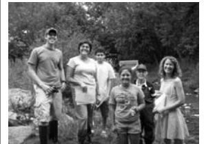
Stream Watch Volunteers