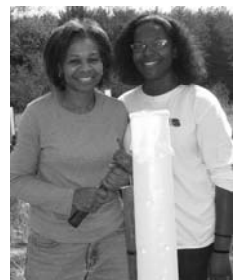
Dept of Aging Volunteers