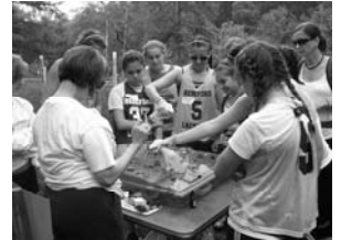
Students at Gunpowder Day