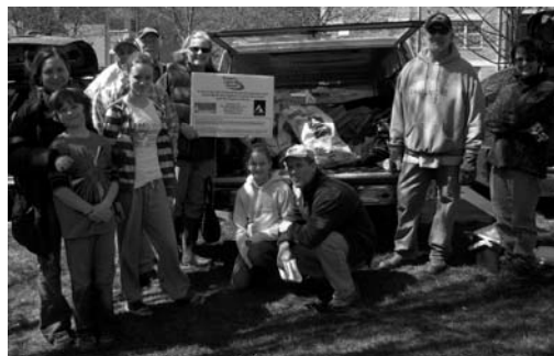
Project Clean Stream Volunteers