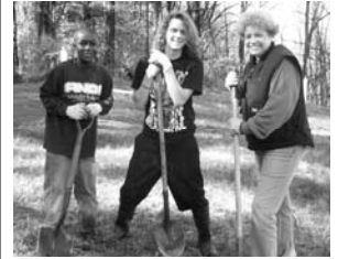
Rosedale School Volunteers