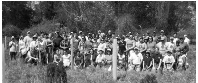
LR Marriot Volunteers at GVC Tree Planting