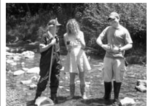
More Stream Watchers