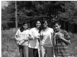
Dept of Aging Volunteers